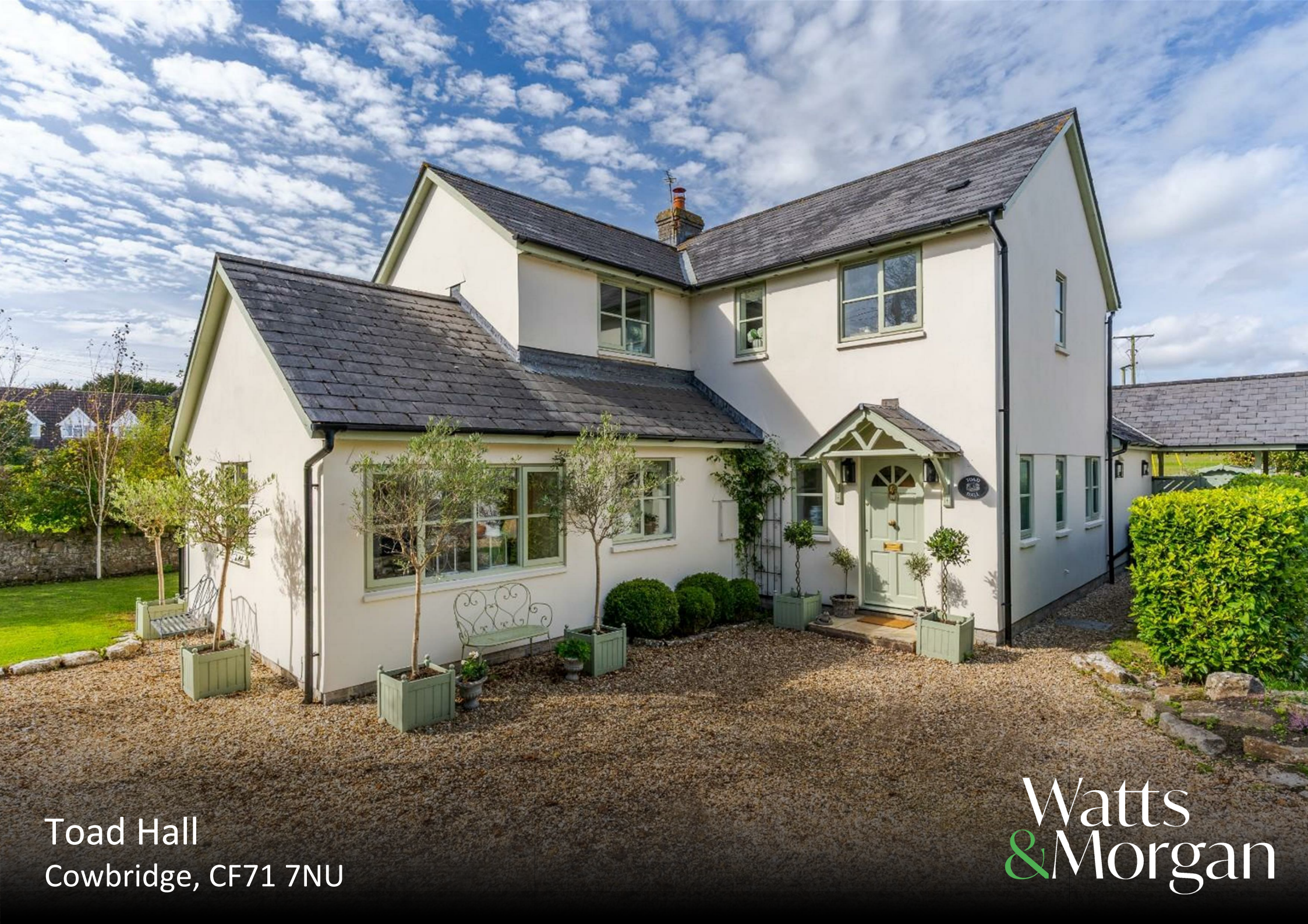
Toad Hall Cowbridge, CF71 7NU